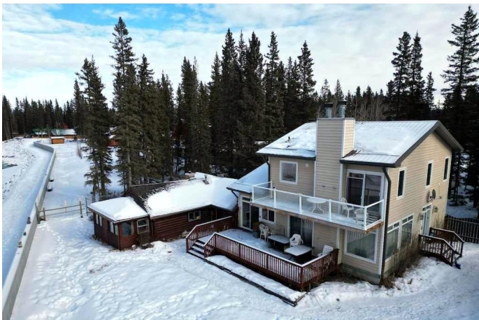
35 RIVER DR N, BRAGG CREEK (MAIN) - 01.20.2025

MAIN 1,098.61 SQ.FT./ 102.06 M2 UPPER 789.63 SQ.FT./ 73.36 M2 RHS AREA 1,888.24 SQ.FT./ 175.42 M2