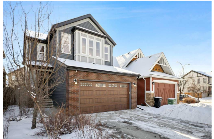
66 COPPERPOND HEATH SE

** Extensive upgrades and superior quality, with 3500 square feet of air-conditioned luxurious living space. You will be impressed with the privacy of an oversized traditional homesite with a private south-facing backyard with a bespoke 13' x 12' covered deck. This seasonal, airy design provides relief from the sunniest to the snowiest days while providing an uninterrupted view of the surrounding gardens. Enjoy this convenient Copperfield Location - Steps away from the ponds, Ice rink, parks, pathways, schools, shopping, soccer, skate park, health care, transit, South Pointe Hospital, and the major south expressways. Living a community lifestyle makes Copperfield an outstanding, safe, and secure community. Rich curb appeal with architectural features - dramatic roof lines, 24' x 21' attached garage with wood-style detailed door & full-sized concrete driveway, covered entry, and brick-faced front complete this spectacular elevation. There are extensive upgrades throughout, and the details are superb. This is a must-see home! Chefâ€™s kitchen includes granite countertops, custom light wood shaker style cabinets/doors, extension trims, high-end KitchenAid stainless steel fridge/dishwasher/microwave/wall oven, gas cooktop range with 5 burners, recessed lighting, oversized central island, peninsula island with a flush eating bar & black granite under mount sink, extra cabinet storage & a