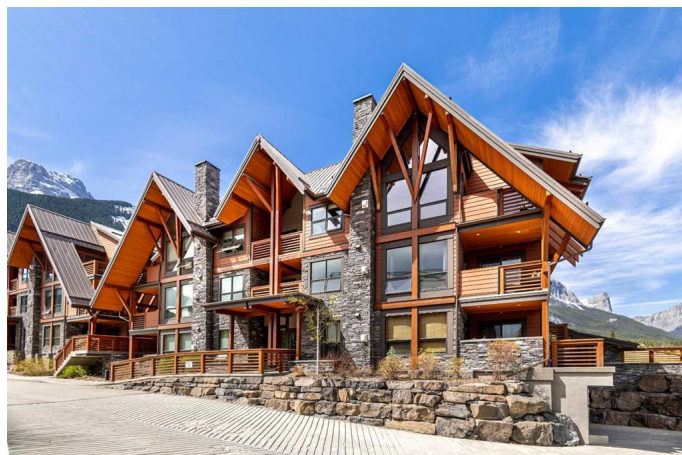
204C-2100 Stewart Creek Dr, Canmore, AB

Secure storage locker conveniently located next to parking