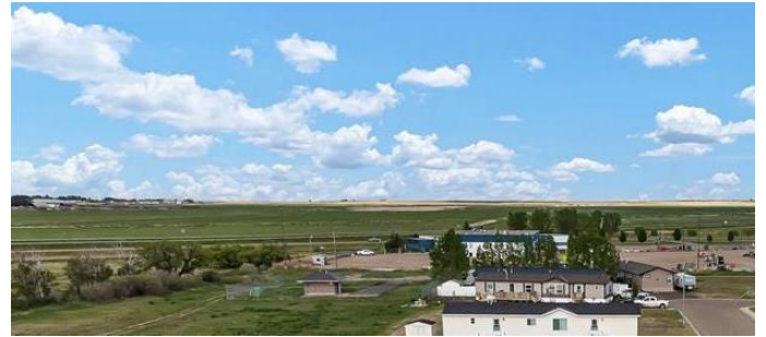
127 Meadowplace Dr E, Brooks, AB

Main Floor Exterior Area 1517.55 sq ft Interior Area 1381.31 sq ft